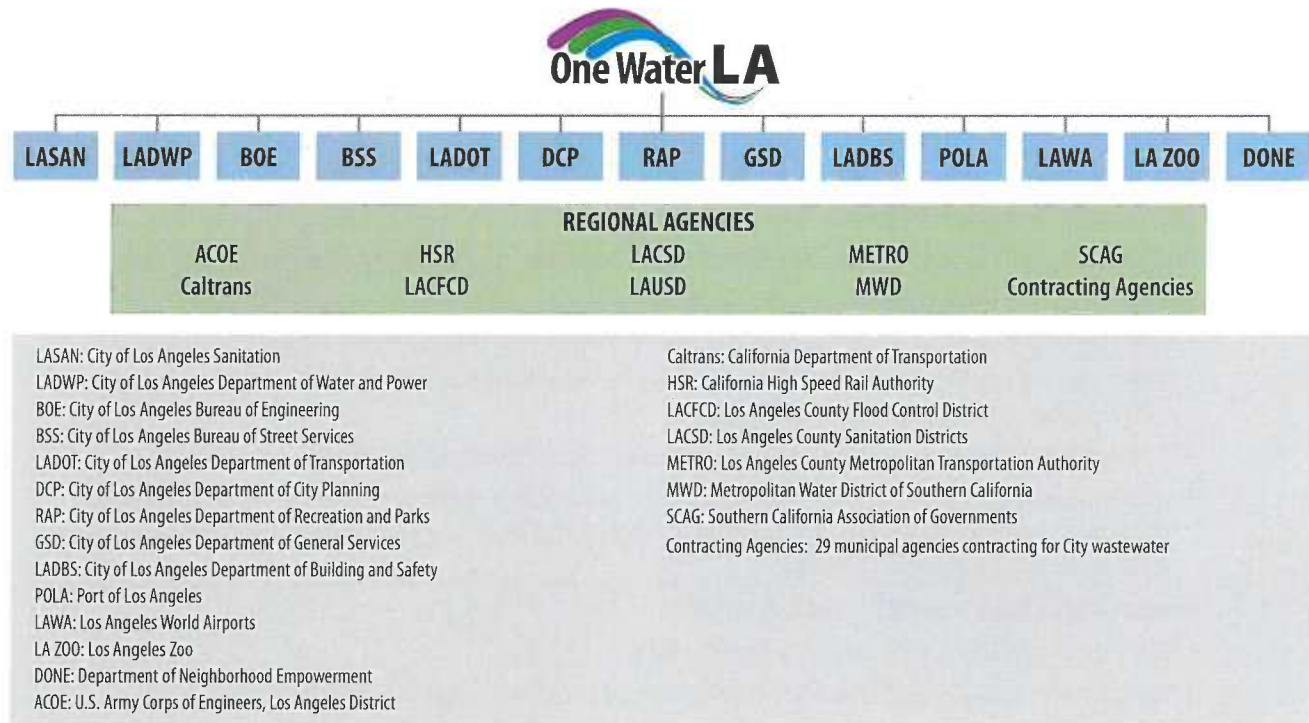
Figure 2. Inter-Department/Agency Coordination

During the Phase 1 of One Water LA, members of LASAN and LADWP staff conducted focus meetings to discuss water management strategies with all of the City departments and most of the regional agencies shown in Figure 2 . These meetings were particularly important given the Mayor’s Executive Directive Number 5 calling for increased levels of water sustainability. Table 2 summarizes the topics discussed in these meetings.