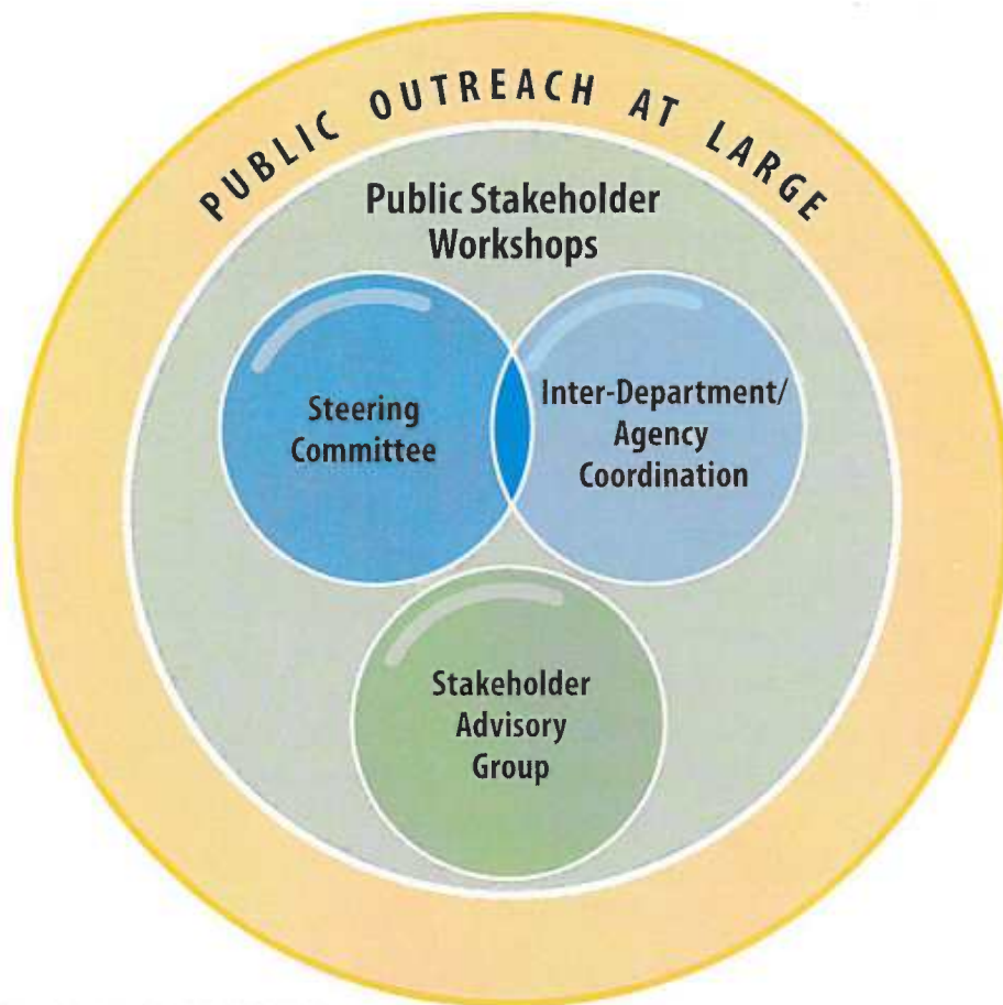
Figure 1. Phase 1 Stakeholder Process

With a goal of increasing and widening stakeholder involvement, Phase 1 of One Water LA had five levels of interactions (see Figure 1 ). Core to the stakeholder process were the interactions between the Steering Committee, Inter-Department/Agency Focus Meetings, and Stakeholder Advisory Group meetings. These core interactions provided direction and content to the Public Stakeholder Workshops. The Public Stakeholder Workshops helped inform the Public Outreach at large.