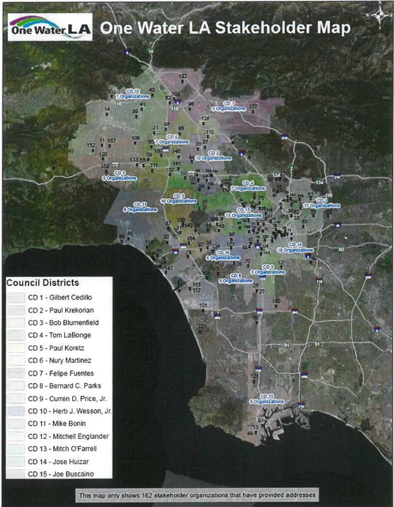
Figure 3. Map of Stakeholder Organizations